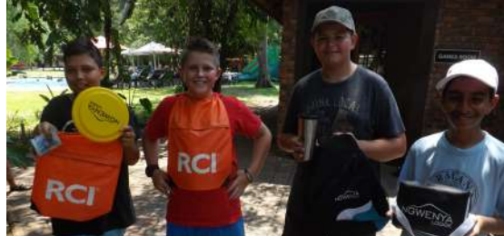
Some of our younger guests with their prizes