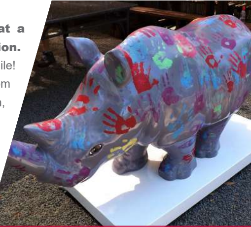
The Ngwenya Lodge Mascot, Ubhejani

As much as we are pleased with these achievements and recognise what a great honour these are, we don't do what we do, for awards and recognition. No, we do it all for you – our cherished shareholders. We love seeing you smile! Whether you are smiling at the little ones having fun during the numerous activities we host (from t-shirt painting, to vintage sports); or beaming while you watch various animals drinking from, wandering along or lazing on the banks of the Crocodile River; while you enjoy a cold one and a delicious pizza or dish, at the Le Fera Restaurant deck. We love seeing you pose for family photos and how you bemoan the family clown for, once again, pulling faces at the camera. We love seeing you walk hand-in-hand with loved ones to the hides or around the Resort grounds, and the way you interact with our staff. It's for reasons like these that we aim to be the best (year-after-year) and be your "diamond" treasure in the bushveld for years to come. With all this top of mind, allow us to expand on the latest happenings at your home-away-from-home.