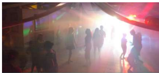
New Year's Dance