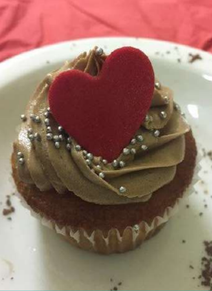
Guest Valentine's Treats